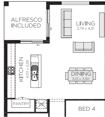
MIRRORED REAR OPTION